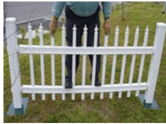
Stringer rails are reinforced with steel for additional strength.