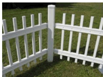
Bracket assembly allows panels to pivot to create angles/corners without the need for an intermediate post