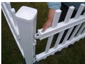
Panels hook onto post brackets for quick and easy assembly