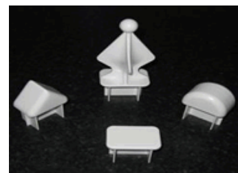
Choice of 4 styles of picket tops