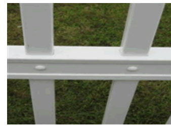
Domed screw caps hide unsightly screw heads and add a feature to the stringer rails