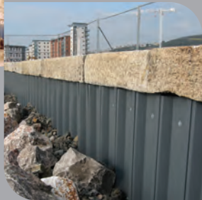
Sea Defence Cladding