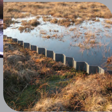
Peat Bog Blocking