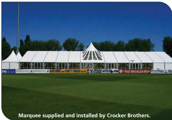
Marquee supplied and installed by Crocker Brothers.

The fencing is easy to construct, will not rot or warp and requires no maintenance other than the occasional clean.