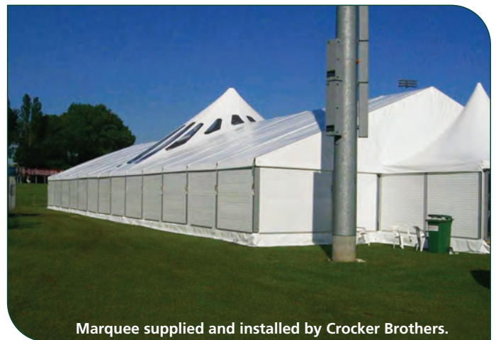
Marquee supplied and installed by Crocker Brothers.

Crocker's have developed a solid marquee wall system which utilises both the Liniar uPVC profile and Crocker's bespoke aluminium profile to create a robust and durable construction.