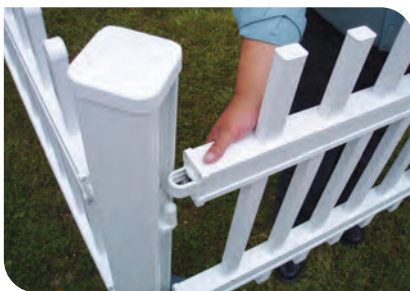
Panels hook onto post brackets for quick and easy assembly.

The panels are supplied pre-fabricated in 2m x 1m high panels, with bespoke sizes also available and can be purchased or hired.