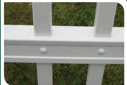
Domed screw caps hide unsightly screw heads and add a feature to the stringer rails.