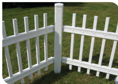
Bracket assembly allows panels to pivot; creating angles or corners without the need for an intermediate post.