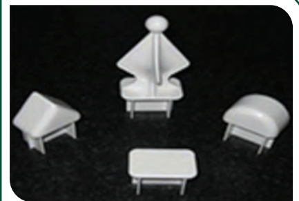
Choice of four styles of picket tops.