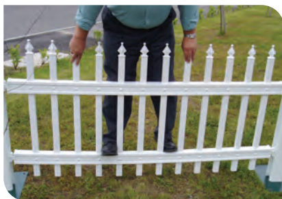
Stringer rails are reinforced with steel for additional strength and durability.